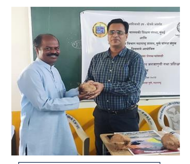
Inauguration of Workshop

Training kits were distributed among the participants. In this workshop there was collaborative participation from officials of State Government organisation, NGO Shashwat and the community.